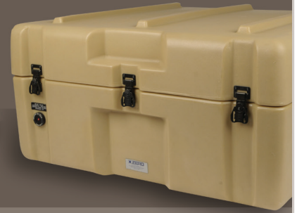
TRANSIT & STORAGE