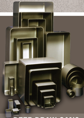
DEEP DRAW CANS